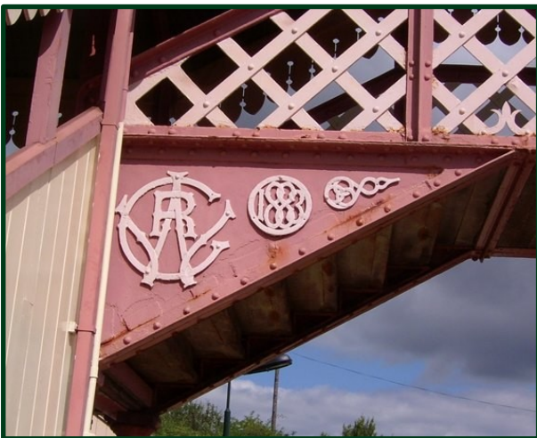
The Badge in Ironwork of the Great Western Railway

A great session on Railway Heraldry, run by Alan, was sandwiched between images that our Leader used first to back up Mike’s previous captivating session, on The “Great Twelve” Worshipful Companies, and lead in to Alan; with, then, after our rail-trip, pictures to lead in to Clare’s opening session of 2014 on the Canadian Provinces in January.