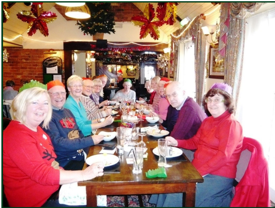
Anoraks at Play - Xmas Lunch in 'The Sal', Members and their Loyal Supporters

As you might tell from this picture, the group puts into practice the dictum of a “healthy mind in a healthy body”, as we stocked up on the calories expended in the previous two hours of hard work in the Feignies Room, some of us in the hands of our Carers.